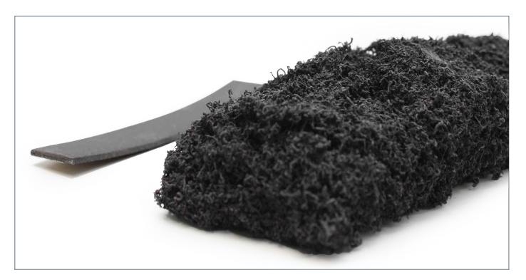
FLEXILODICE before and after exposure to fire.

The microporous layer formed during expansion prevents the passage of any flames, smoke or hot gases.